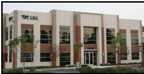
GBG Corporate Headquarters Southern California, USA